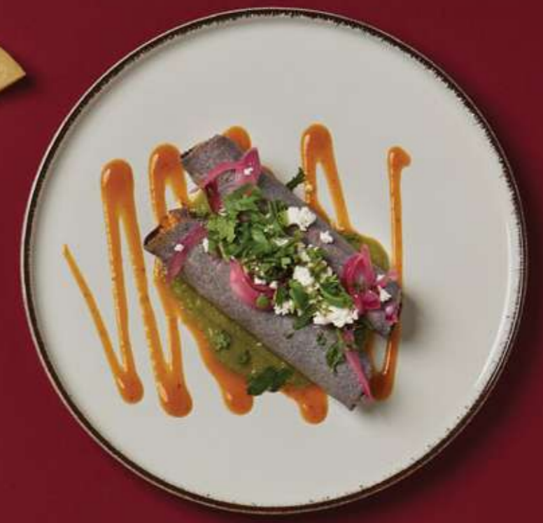
FLAUTAS CON POLLO