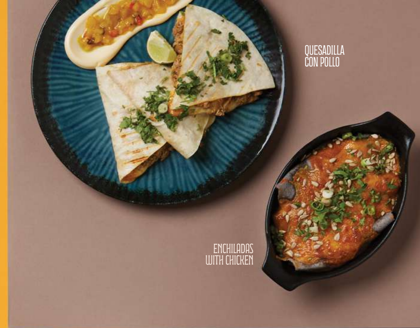
QUESADILLA CON POLLO