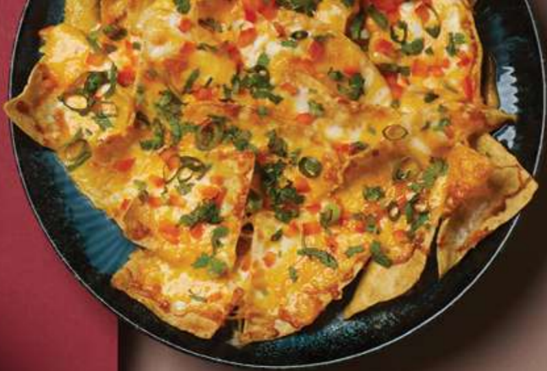
NACHOS WITH CHEESE