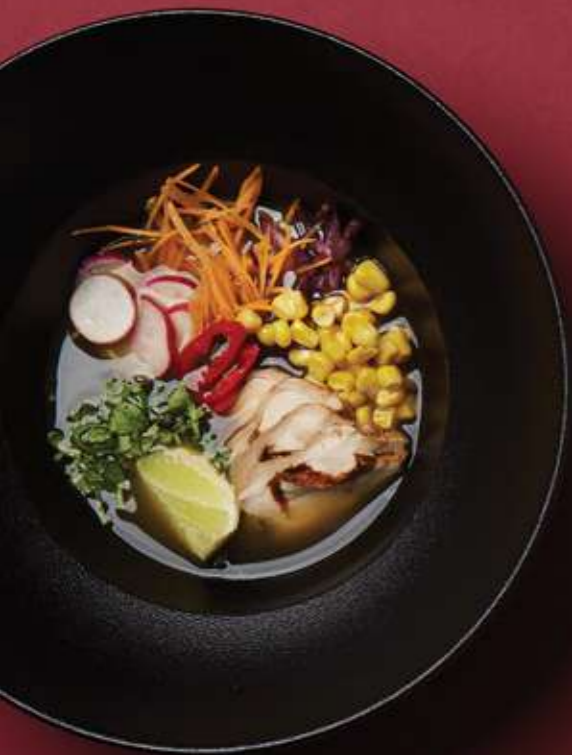
MEXICAN CHICKEN SOUP