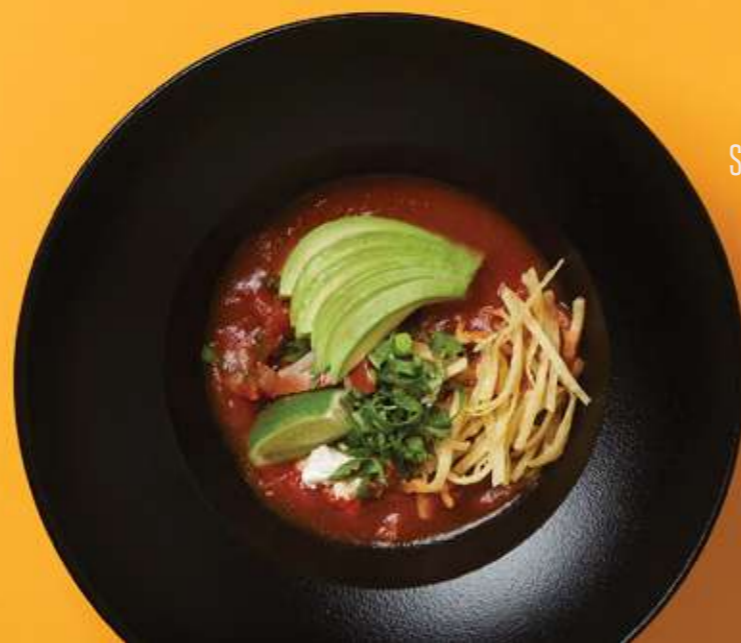
SOPA AZTECA CON VERDURAS