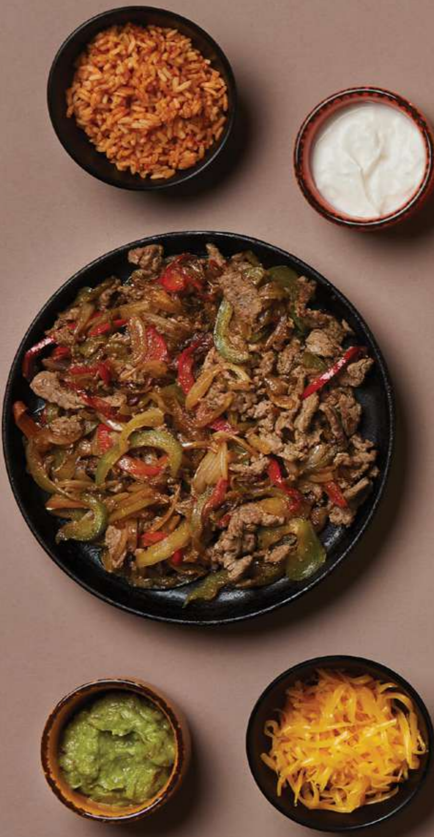
FAJITAS WITH BEEF TENDERLOIN