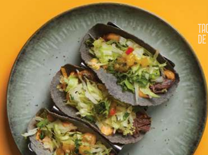
TACOS DE CARNE