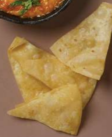
AGUACATE CON QUESO