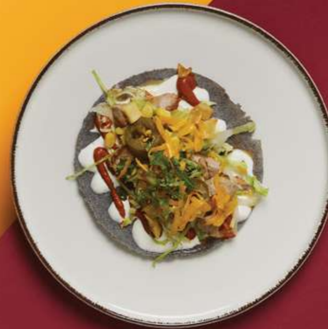
TACOS CERDO ASADO