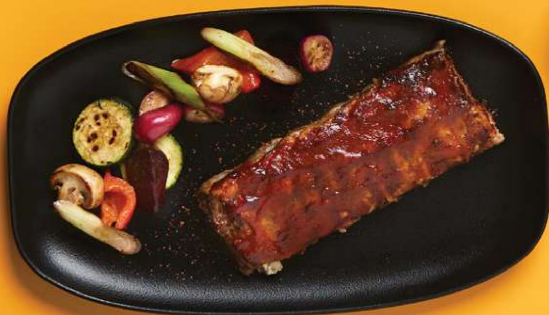
RIBS ADOBO BBQ