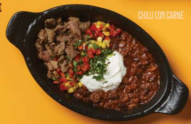
CHILLI CON CARNE