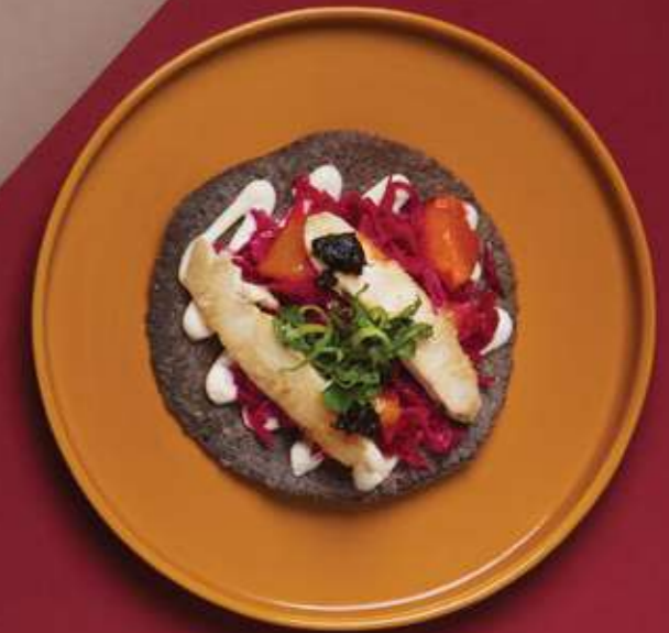
TACOS POLLO MANI