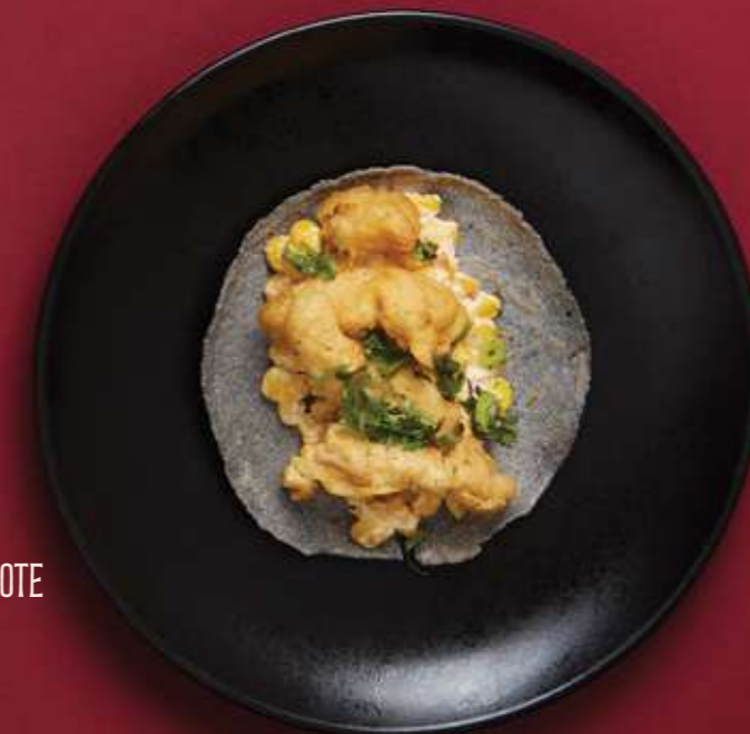
TACOS DE ELOTE