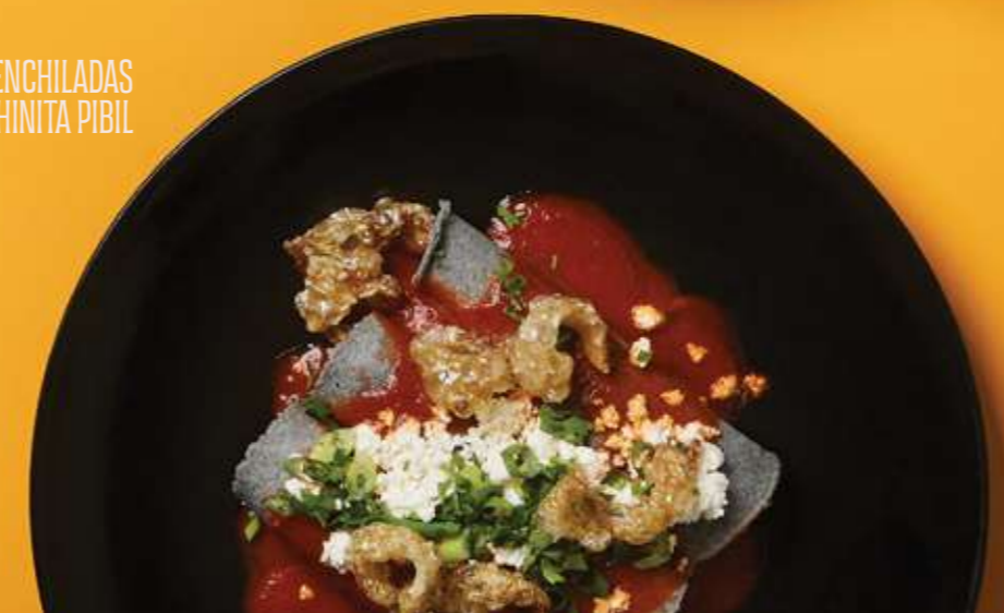
ENCHILADAS COCHINITA PIBIL