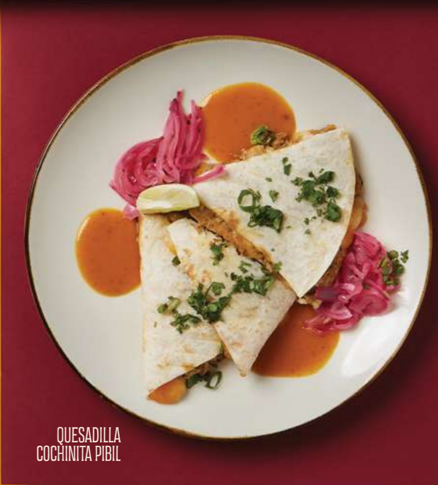
QUESADILLA COCHINITA PIBIL